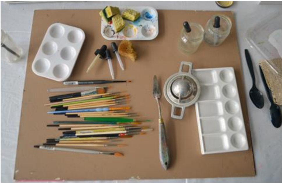
Waterproof ink and earth tone dry pigments